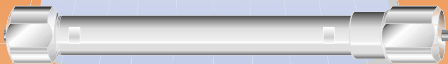
semipreparative HPLC column